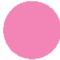
Zhí-ego o Pink