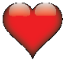
Nó o de Heart