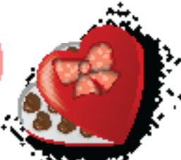
Zho o ná Candy

Zhe o ná-tho o wíí. I give you candy. (something round/shaped)