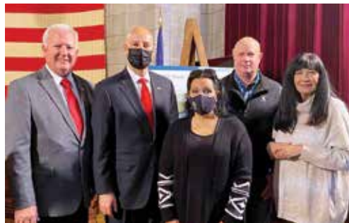
Tribe of NE. Along with the tourism aspects, the STAR WARS projects will result in job growth, economic development, increased tax dollars, and enhanced lifestyles.