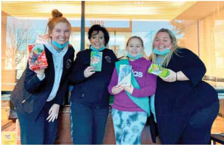
Ponca Tribe of NE members residing in the district to purchase the cookies from and were