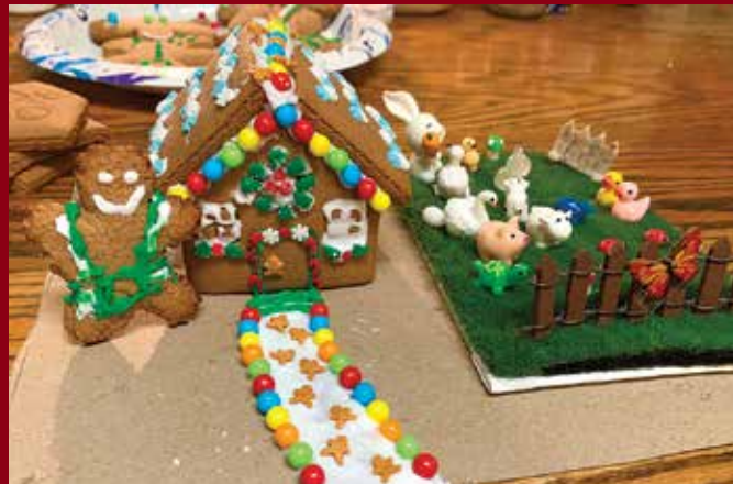
Second Place - Rita Pitzer