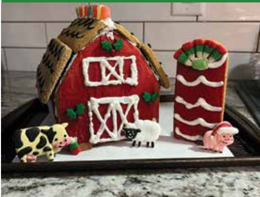
First Place - Rylen Meins