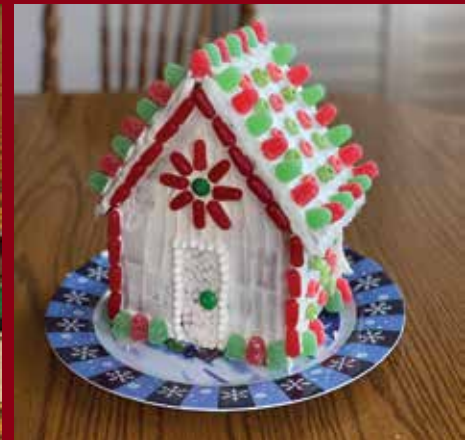
Third Place - Cami Schott