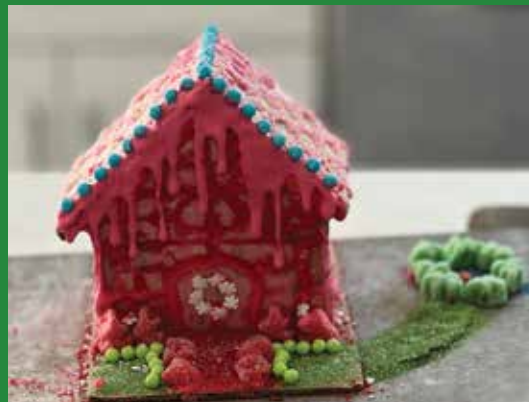
Second Place - Everley Howell