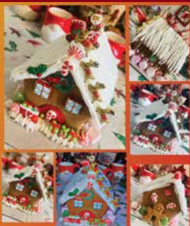
First Place - Liz Venegas